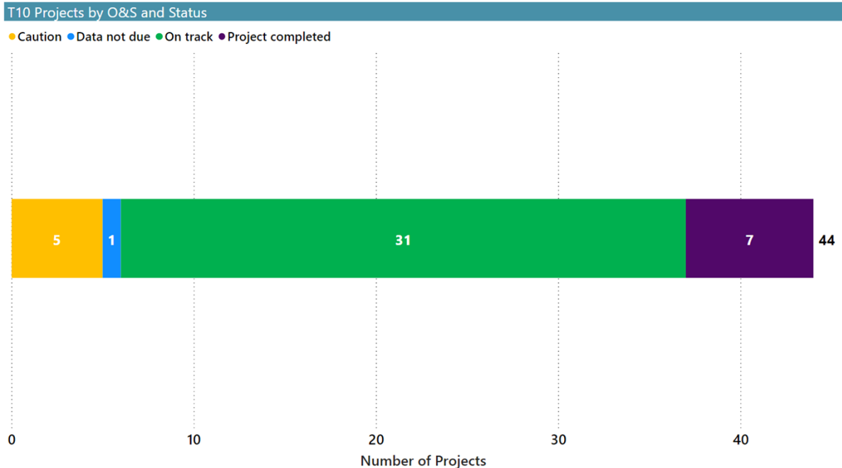
Figure 2 – Projects by Status

Details of the programmes, projects and performance indicators with a concern or caution status together with an explanation of their performance and improvement plan can be found in Appendix 1